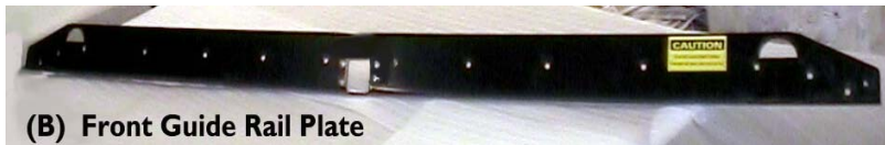
(B) Front Guide Rail Plate